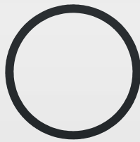
Round Tube Max Dia : 152 Ø