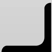
Angle Iron Max Diagonal : 170mm Max length of one side : 152mm