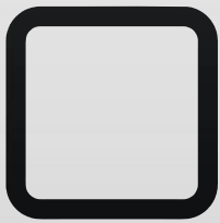
Square Tube Max Square : 120mm