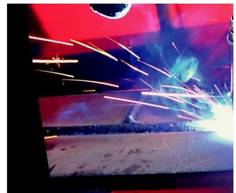
Caliburn high definition plasma cutter