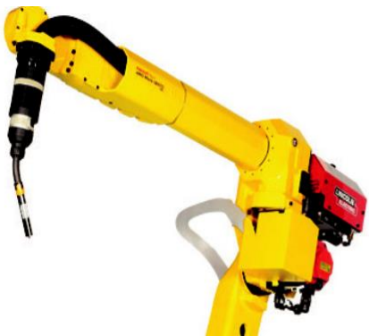
Robotic and manual welding machines