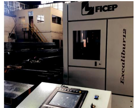
Ficep beam drilling line