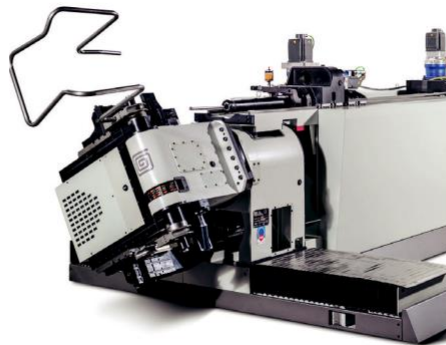
BLM tube benders