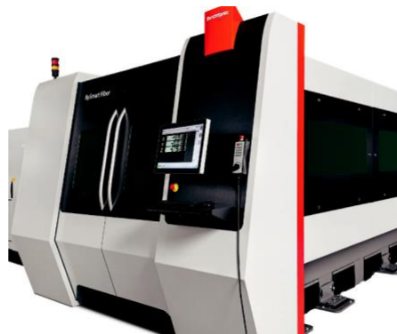
Bystronic fibre lasers and Bystronic press brakes